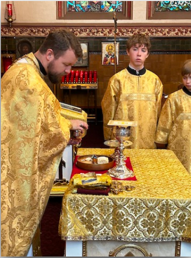
Proskomedie Sermon from Sunday, September 8th

COFFEE HOUR will take place after Divine Liturgy in the Main Hall, all are invited downstairs! And a special thank you to everyone who makes it possible to have our coffee hour; our teams, our volunteers, all without fail. God grant them many years! Mnohaja i Blahaja L'ita!