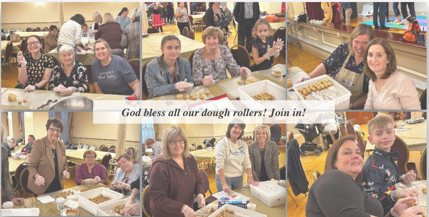
God bless all our dough rollers! Join in!